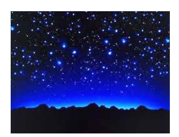
"Constellation of Stars"

On Saturday, the second of May Two thousand and fifteen at Six o'clock in the evening